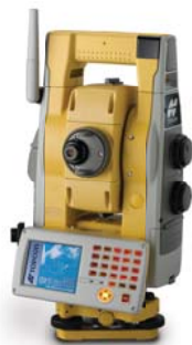
GPT-9000A/GTS-900A SERIES Advanced Robotic Instrument System

Topcon's new 9000-series Robotic Systems: Superior Technology - Superior Design - Superior Performance and Value: only from Topcon, the World Leader in Precision Measurement Technology.